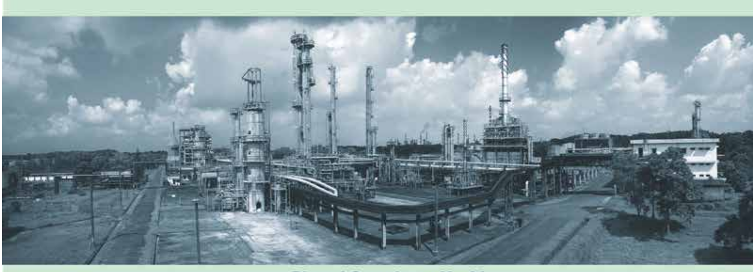
Phenol Complex at Kochi